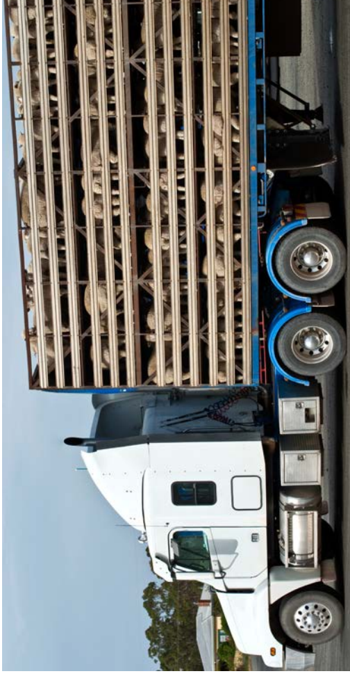
Some trucks carry animals.