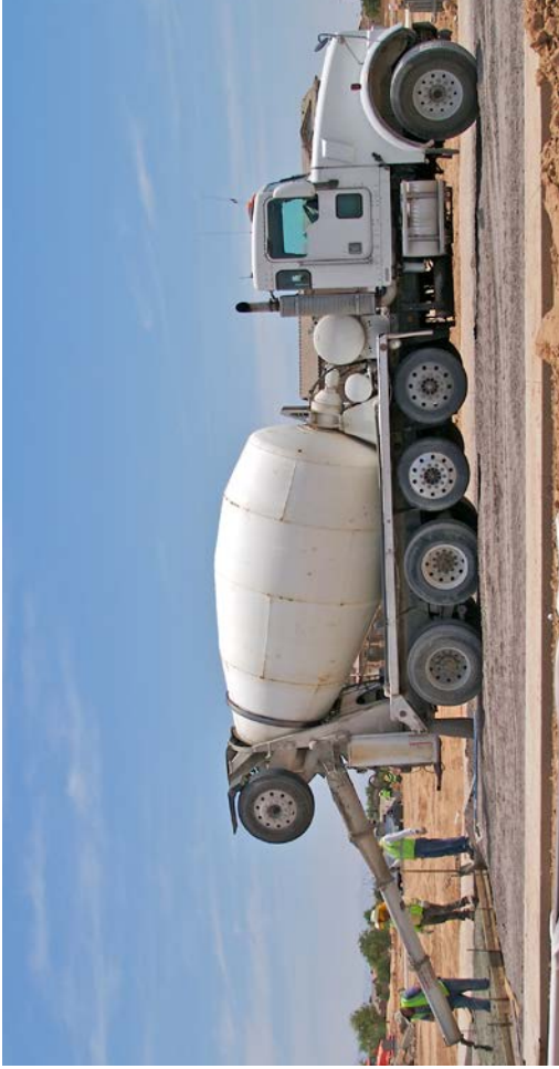
Some trucks carry cement.