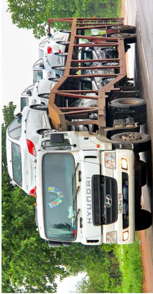
Some trucks carry cars.