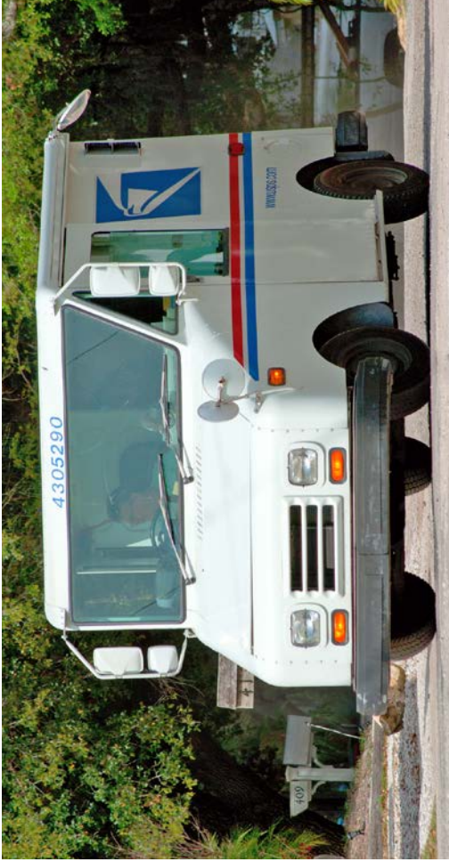
Some trucks carry mail.