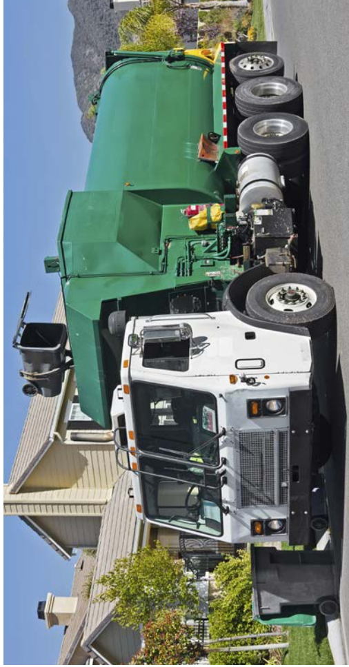
Some trucks carry garbage.