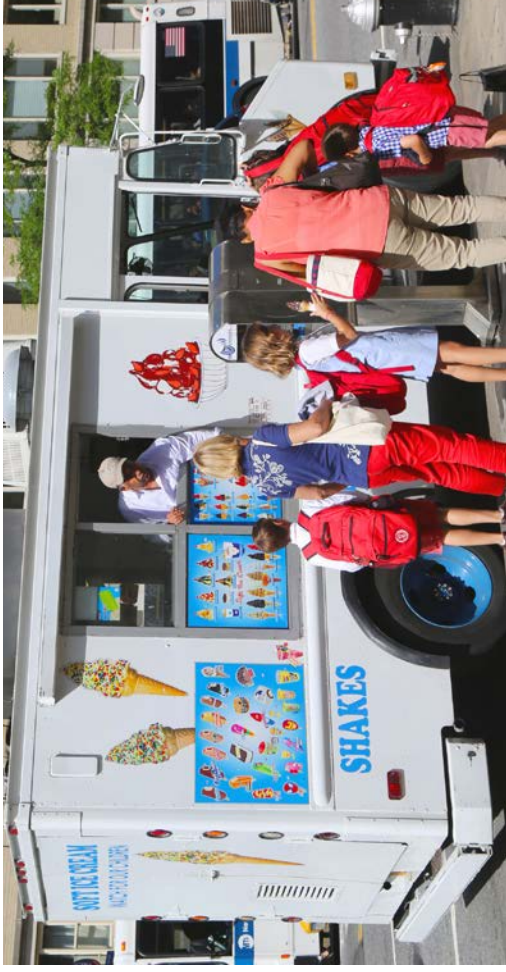
Some trucks carry ice cream.