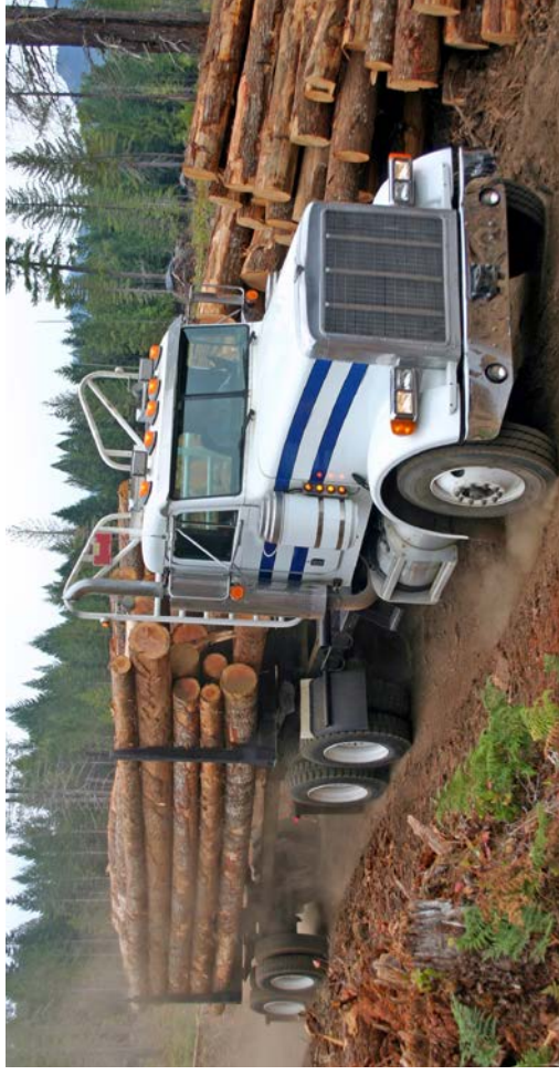
Some trucks carry logs.