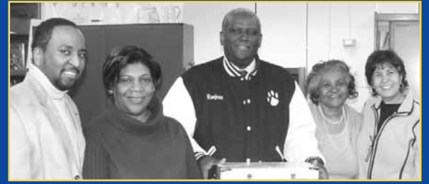
The Hempstead Public Schools administration thanks district voters for approving the Prospect School Bond Project.

District voters approve $18.1 million bond project to renovate historical school building into a districtwide Kindergarten Center