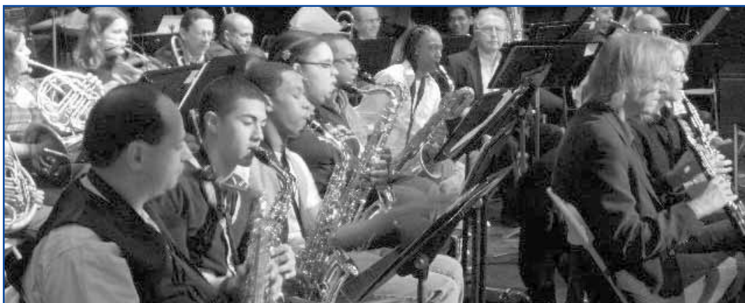
The Hempstead High School Concert Band also performed with the Long Island Philharmonic in March.

The performance marked the second time Hempstead High students performed alongside well-known industry musicians. In March, the school's Concert Band also hit the stage with the Long Island Philharmonic for a joint concert. The district was one of only five school districts in the county selected to perform side-by-side with the orchestra this year as a participating partner in the organization's MusicLivz Arts-In-Education Program.