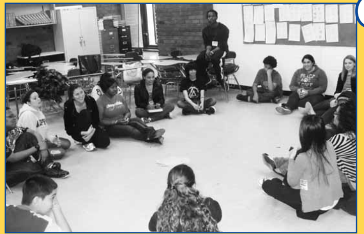
The Teamed for Success Mentoring Program at Hempstead High School features group activities where teens can discuss their school goals and career plans with Adelphi University students.